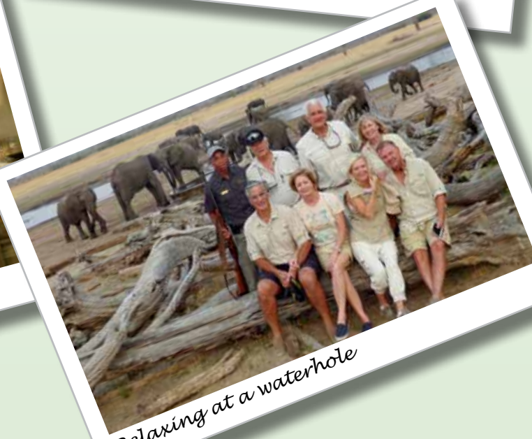
Relaxing at a waterhole