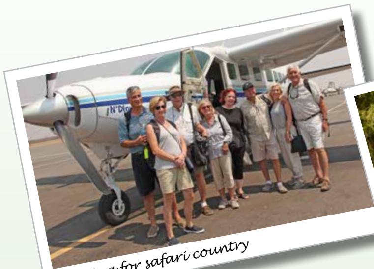
Leaving for safari country