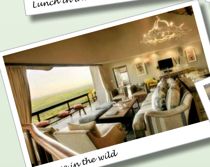
Lounge in the wild