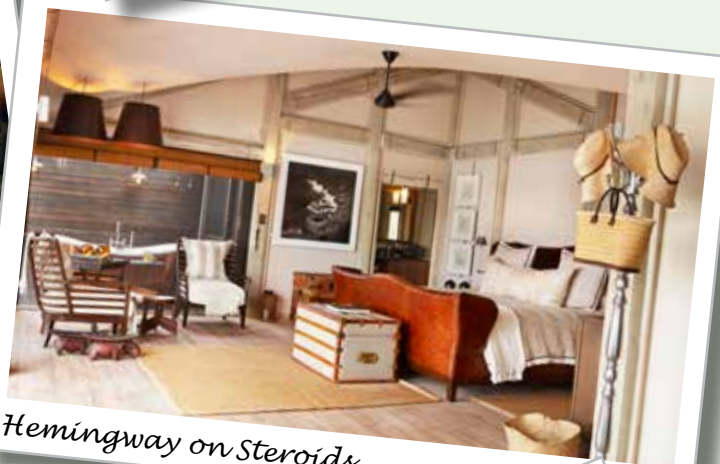
Hemingway on Steroids