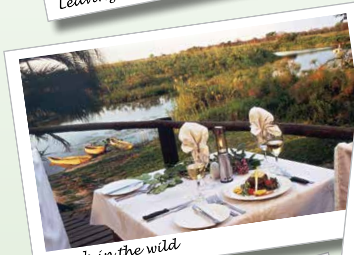
Lunch in the wild